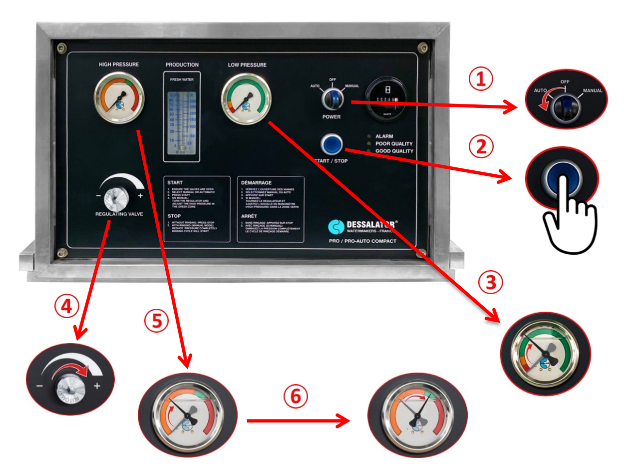
→ Note: The fresh water yield depends on the temperature and salinity of the sea water and the cleanliness of the 5 & 25 micron filters (in the pre-filter).